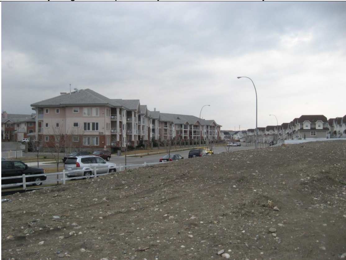
Tuscany Development Adjacent to Tuscany LRT Station