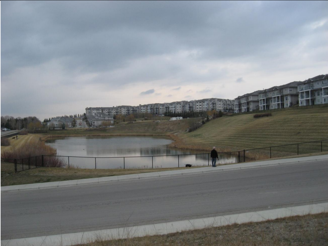
Rocky Ridge Development Adjacent to Future Tuscany LRT Station