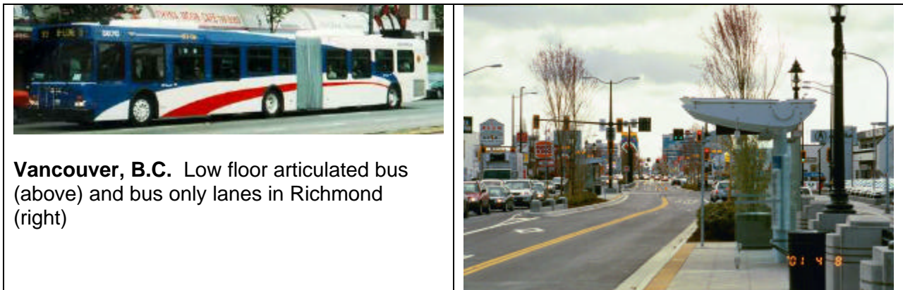
Vancouver, B.C. Low floor articulated bus (above) and bus only lanes in Richmond (right)

In Vancouver, British Columbia, the first phase of 'Rapid Bus' service – 'B-Line' began operating in 1996 September between the downtown and the University of British Columbia. 'B-Line' service is provided using standard and articulated low floor buses operating every 4 minutes in the peak and 8 minutes in the off-peak. The service was successful in increasing ridership (20% of new customers were previous auto users), and reducing travel times by 20 to 40 percent. The service averages 62 boarding passengers per hour. A new 'B-Line' service is being implemented between Richmond and Vancouver via Granville Street. Exclusive bus lanes have been constructed in the Richmond commercial district. Rapid Bus service is planned to provide 3 minute peak and 10 minute off-peak service with a proof of payment system for faster boardings.