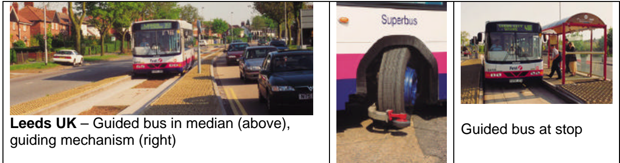
Leeds UK – Guided bus in median (above), guiding mechanism (right)