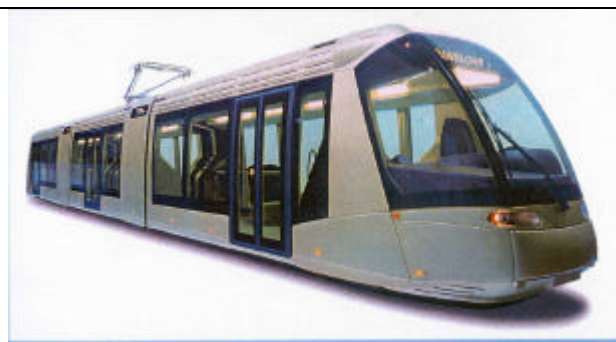
Translohr by Lohr Industrie