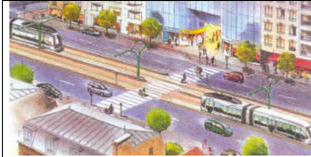
Trams Operating in Street Median