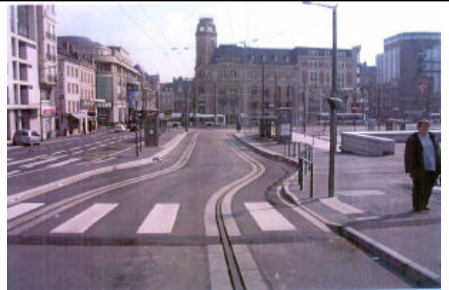
Guided Tram Station - Nancy, France