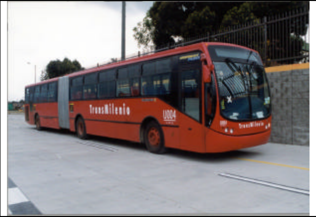
Bogota Columbia - Articulated Bus