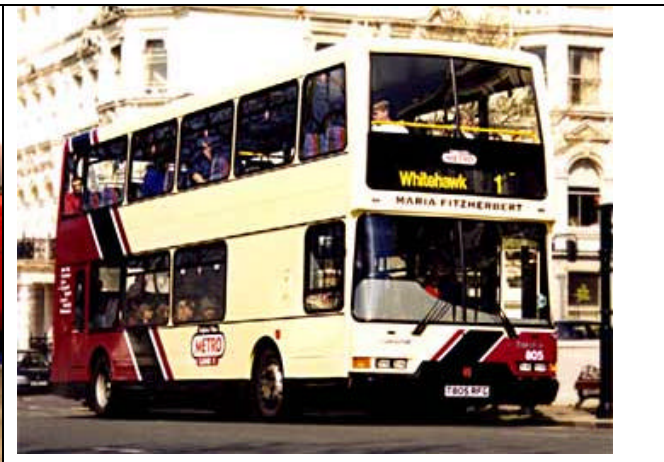
Dennis Manufactured Bus as Used in Victoria B.C.