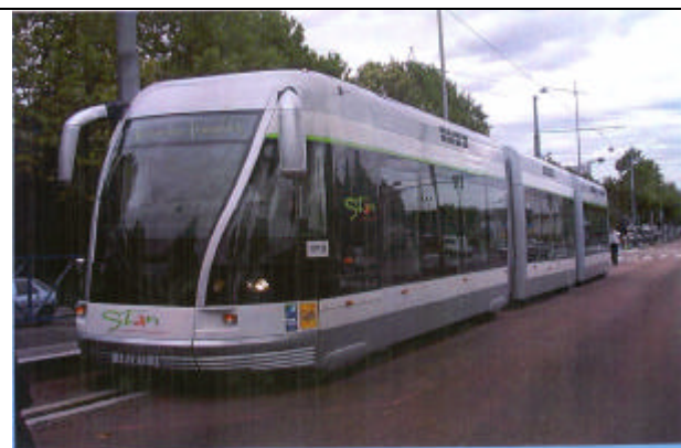
TVR by Bombardier

Electric trams are being developed, primarily by manufacturers for European markets. These vehicles are similar in appearance to Light Rail Vehicles (LRVs) but operate on rubber tires versus rail. Examples of this new technology are typically articulated with capacity for up to 200 passengers. Rubber tire trams can operate on separate or shared rights-of-way with electric power provided by an overhead catenary or via an innovative in-ground power supply. Some vehicles under development have the option of being 'guided' by a single street track or via video camera to facilitate operation in narrow rights-of-way and at stations where precision stops are required. Although, most of these trams are being developed and tested in Europe, the City of Los Vegas has purchased new technology trams for a short demonstration service to start in 2002. These vehicles are still under development but are likely to cost approximately $3.0 million per unit.