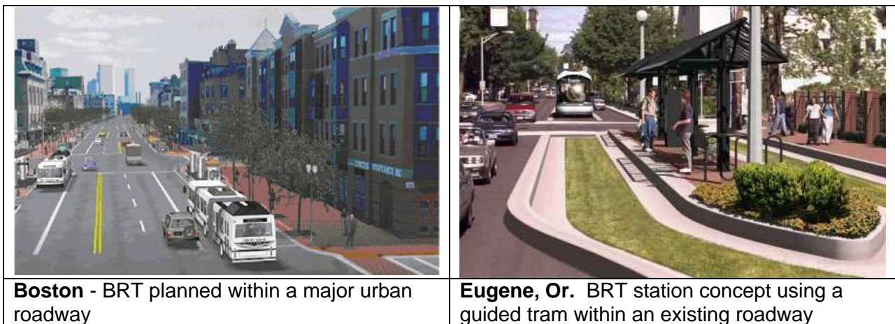
Boston - BRT planned within a major urban roadway

BRT is being examined or planned in a number of United States cities. Each study is reviewing BRT in comparison to LRT. The higher capital costs of LRT and the somewhat disappointing performance of some recent LRT systems in the USA has increased focus on BRT. In each city, the BRT concept is being adapted to the local environment and conditions to address unique situations and opportunities. In addition to the typical BRT transit priority measures and limited stop routes, these projects include elements such as guided busways, new fare systems, high capacity electric trams, and buses with hybrid diesel/electric power