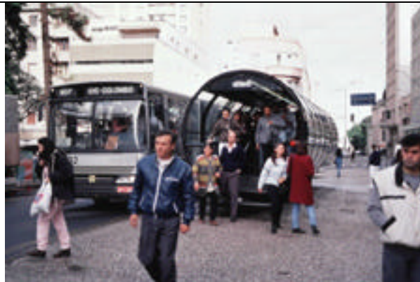
Curitiba Brazil. Large articulated buses operate on shared roadways or in exclusive bus lanes located in the median (left). Bus stop, 'tube' stations provide level boarding at all bus doors and fares are prepaid in the station before boarding (above).