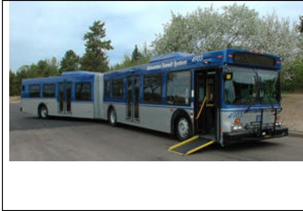
Edmonton's Articulated Bus